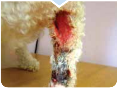
Start of HP Healing Cream