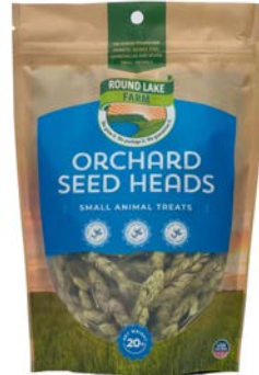
20G ORCHARD SEED HEAD TREATS