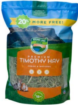
18OZ TIMOTHY HAY