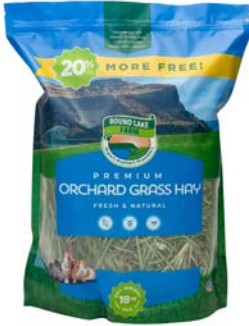
18OZ ORCHARD GRASS HAY