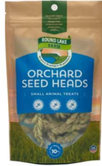
10G ORCHARD SEED HEAD TREATS