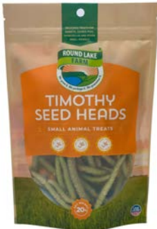
20G TIMOTHY SEED HEAD TREATS