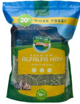
18OZ ALFALFA HAY