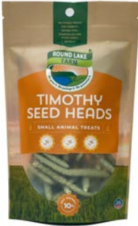
10G TIMOTHY SEED HEAD TREATS