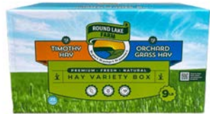
9LB TIMOTHY & ORCHARD GRASS HAY