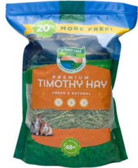
48OZ TIMOTHY HAY