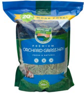
48OZ ORCHARD GRASS HAY